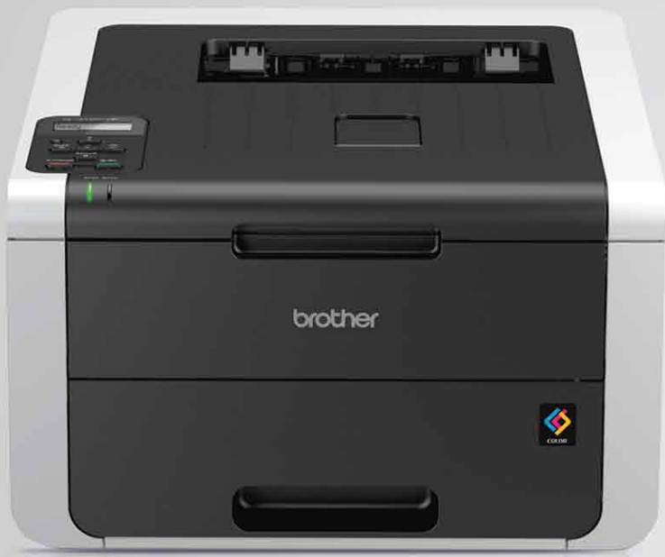
Colour LED Printer with Networking Capability